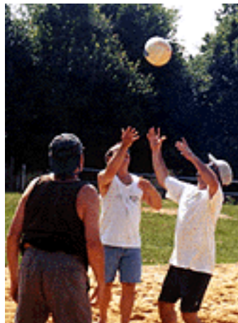
Volleyball Phlocking in Middleburg