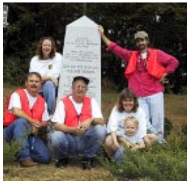
Keeping Signal Hill clean at our new Manassas location