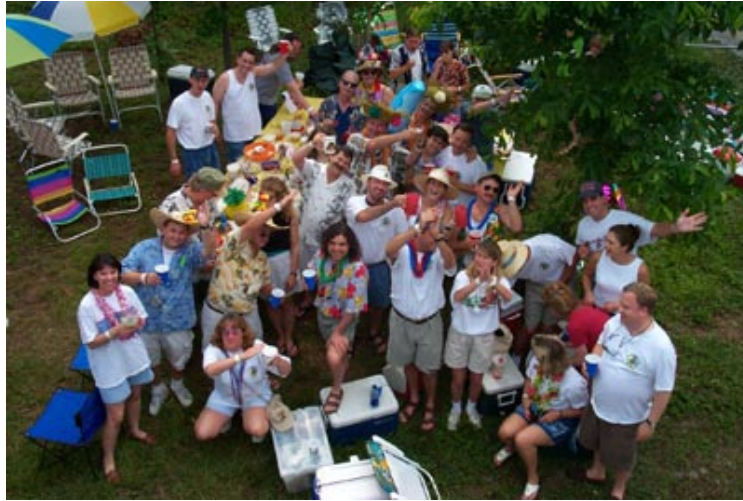
Before the rains came at Nissan.