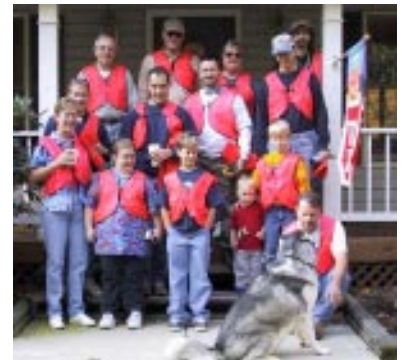
Nice crew for a Rt. 15 cleanup