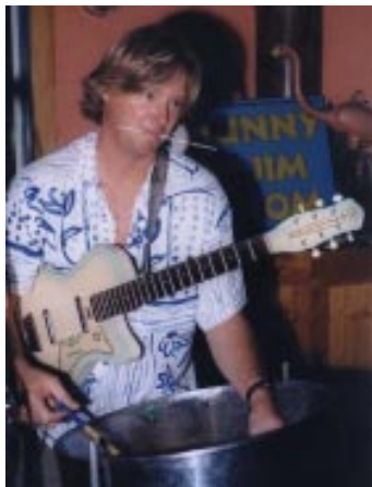
A visit from Sunny Jim