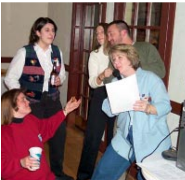
Not the Coral Reefers